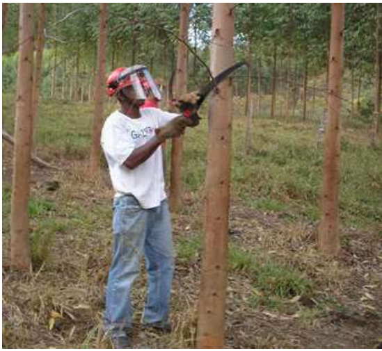
Fig. 3: Pruning for Clear Wood