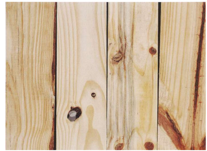
Fig. 5 : Conventional Wood