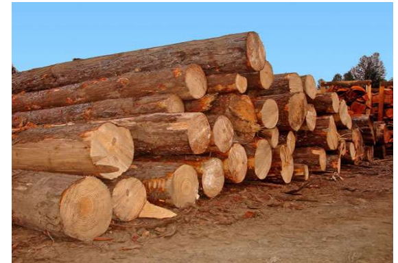
Fig. 1: Eucalyptus logs "in nature"