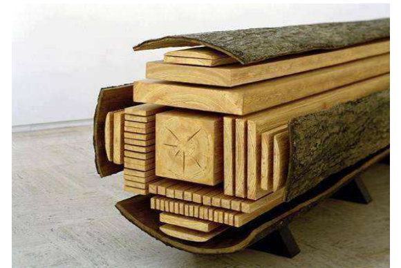
Fig. 2: Multi-purpose wood